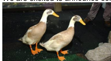
Betty and Martha - our Indian runner ducks