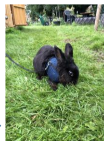
Ella - our dwarf rabbit